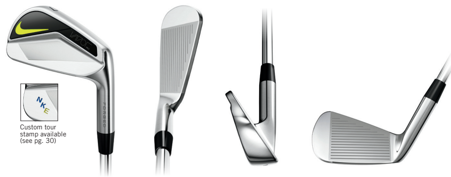
Custom tour stamp available (see pg. 30)